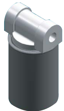
300HS w/50003 Adaptor